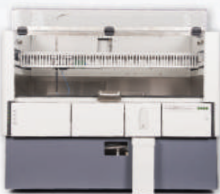
EUROIMMUN Analyzer I